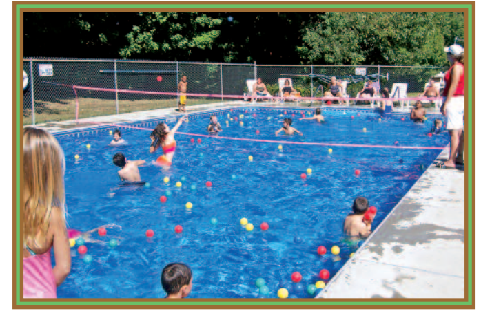
25x51' Swimming Pool RECREATIONAL FACILITIES